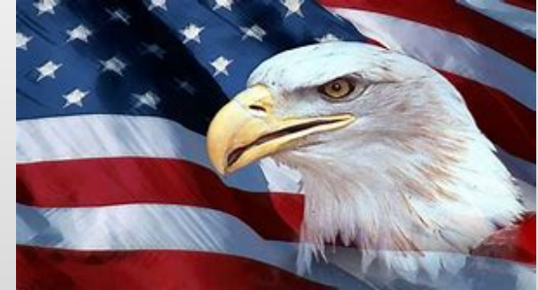
God Bless America