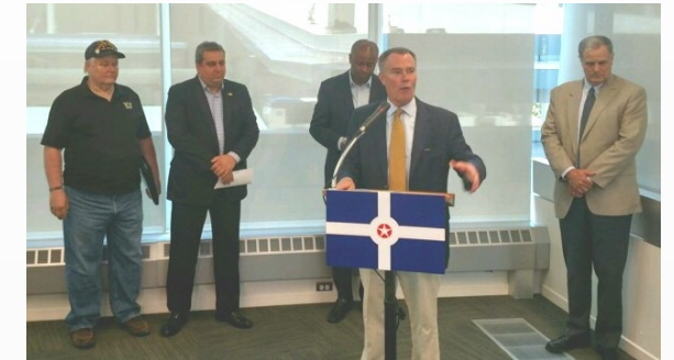
Press Conference: City of Indianapolis awards FREE Bus Passes to Indy Veterans.

To Promote Awareness, by encouraging communities and Veteran Organizations to get more involved by helping them bring awareness of various Veterans issues on ways to help support Veterans, Military and their Families in their communities.