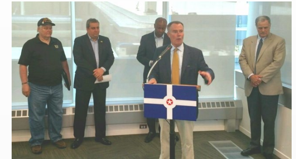
Press Conference: City of Indianapolis awards FREE Bus Passes to Indy Veterans.

To Bring Together Veteran Organizations and Service Providers to Help Build a Nationwide Database that will compile, local, state and federal information on where Veterans, Military and their Families can get the goods, services, programs and benefits they will need to help them succeed. This information will be shared with all other organizations, Veterans, Military and their Families.