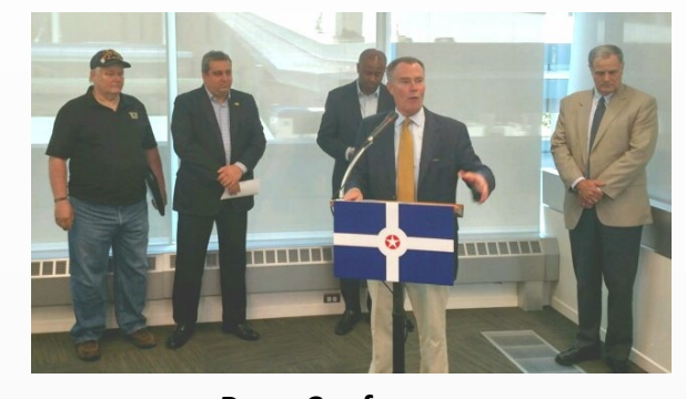
Press Conference: City of Indianapolis awards FREE Bus Passes to Indy Veterans.

To Promote Awareness , by encouraging communities and Veteran Organizations to get more involved by helping them bring awareness of various Veterans issues on ways to help support Veterans, Military and their Families in their communities.