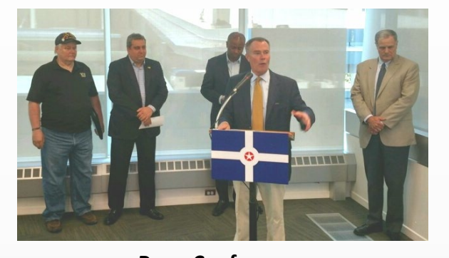
Press Conference: City of Indianapolis awards FREE Bus Passes to Indy Veterans.

To Bring Together Veteran Organizations and Service Providers to Help Build a Nationwide Database that will compile, local, state and federal information on where Veterans, Military and their Families can get the goods, services, programs and benefits they will need to help them succeed. This information will be shared with all other organizations, Veterans, Military and their Families.